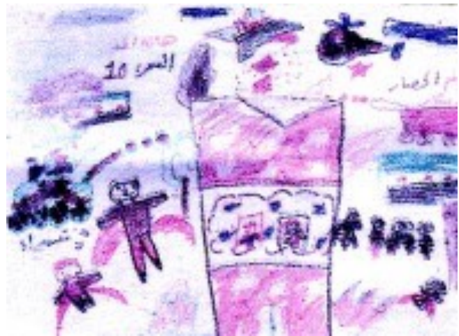
Childs Art from refugee camp

http://muftah.org/special-collection-syria-left/#.WGf8gPkrLDf