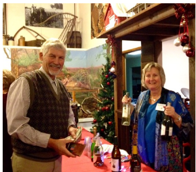
Holiday Gathering Cheer