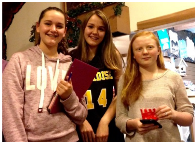
Tech Trekers at Holiday Gathering