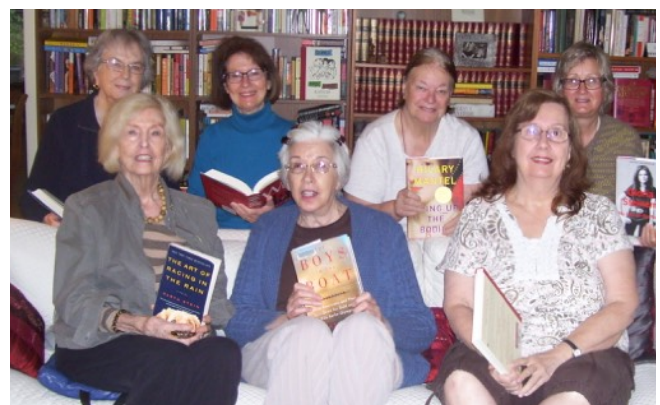
Morning Book Group