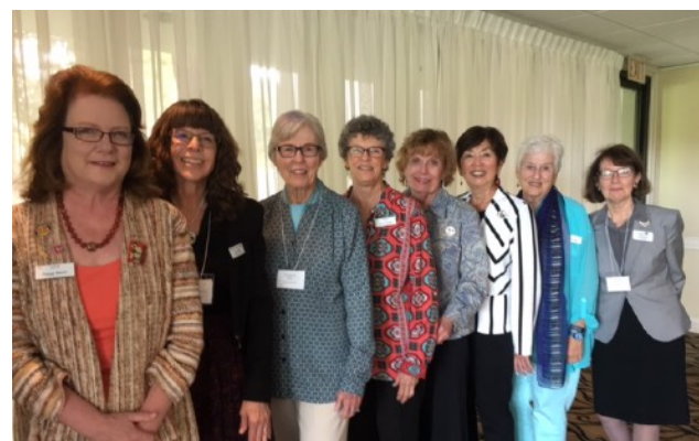
Morgan Hill Members at Funds Luncheon