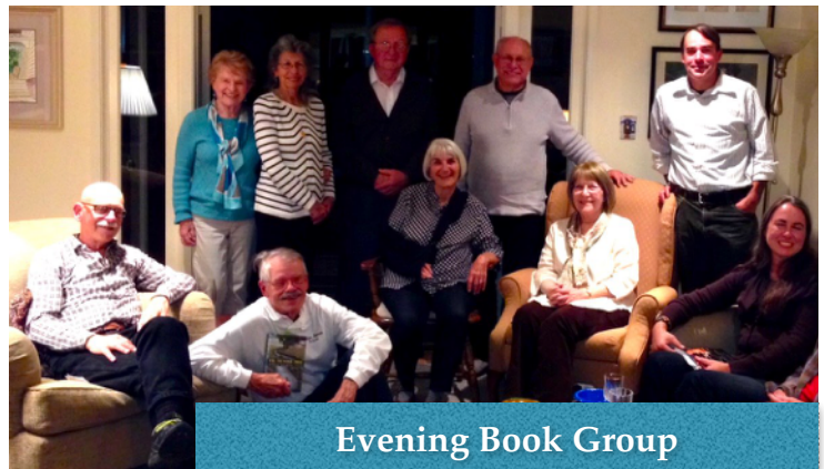
Evening Book Group