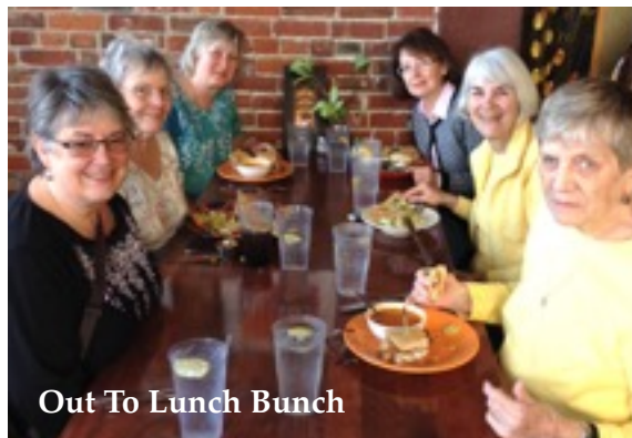
Out To Lunch Bunch

To include your picture taker, take two pictures. Please send pictures as an Attachment, so she can print them on her computer. For any questions please call Marygrace. 530.873.6252