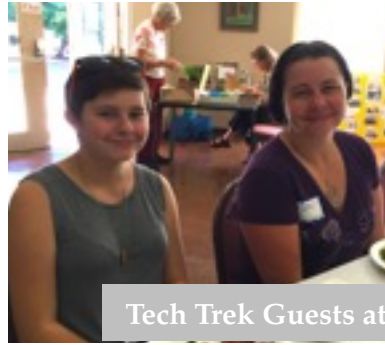
Tech Trek Guests at Fall Luncheon