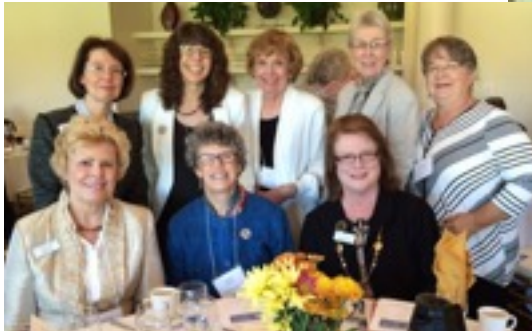
Morgan Hill Branch members