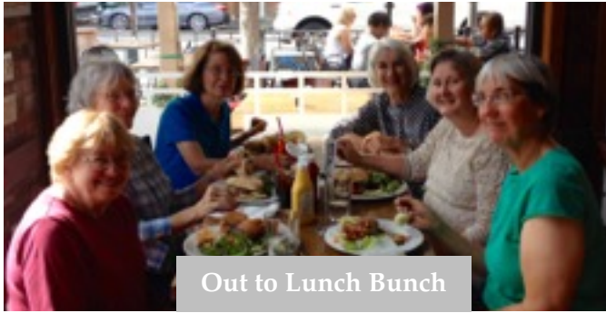
Out to Lunch Bunch